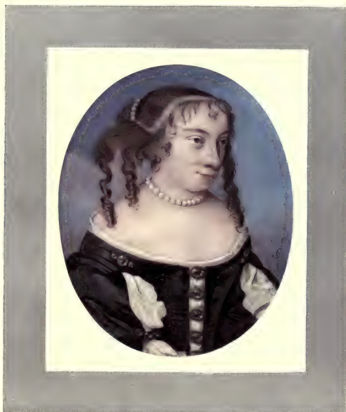
VISCOUNTESS FAUCONBERG, DAUGHTER OF OLIVER CROMWELL BY SAMUEL COOPER